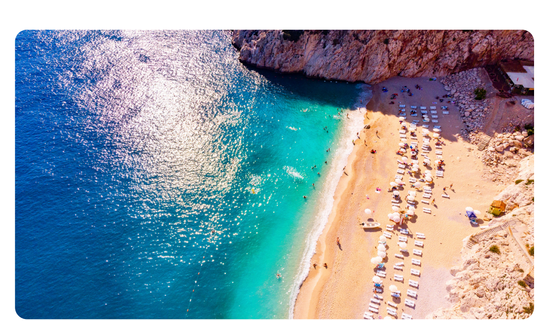
Konyaaltı & Lara Beaches:

A maze of narrow streets with Ottoman-era architecture.